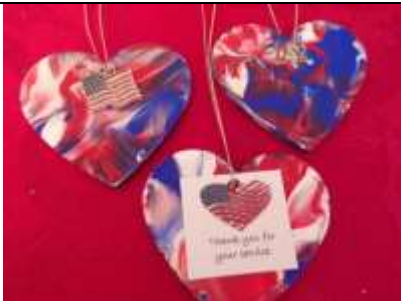
Figure 27. Poured Paint Hearts Donated to Veterans