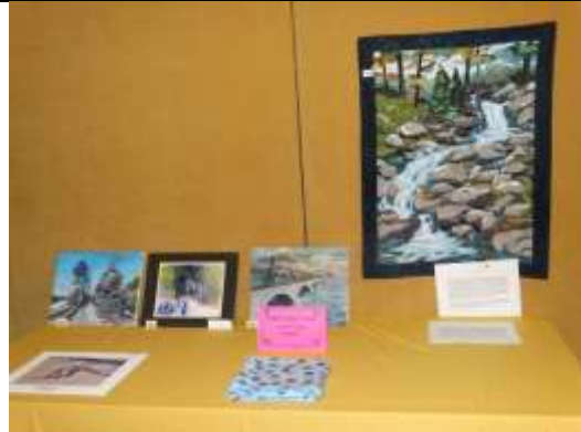
Figure 16. Selection of Railroad Themed and Non-Railroad Themed General Arts and Crafts