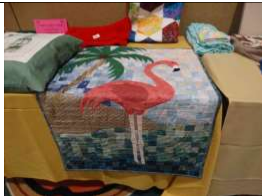
Figure 18. Non-Railroad Themed Quilt