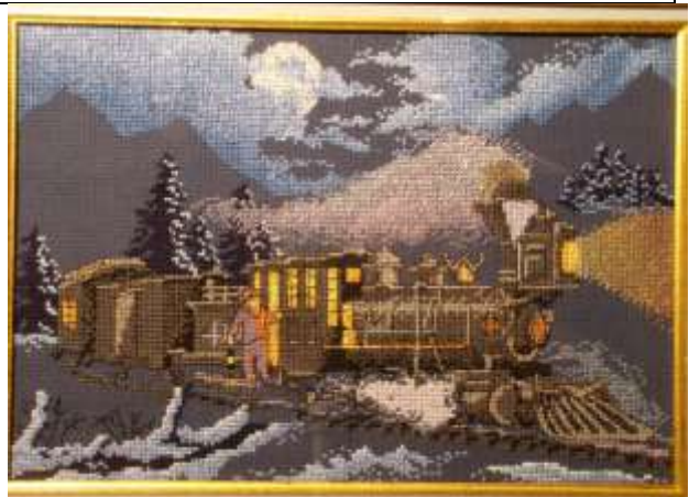
Figure 22. Railroad Themed Cross Stitch