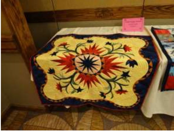
Figure 5. Non-Railroad Themed Quilt