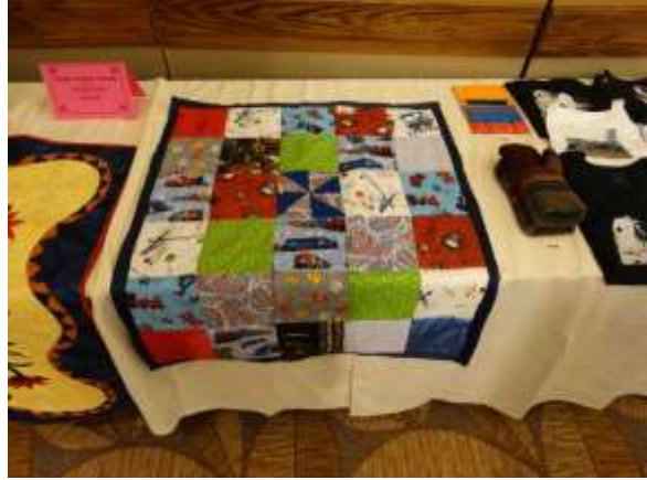
Figure 6. Railroad Themed Quilt