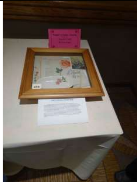
Figure 8. Railroadiana -- Mixed Needlework and Porcelain