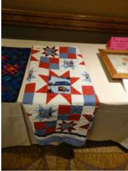
Figure 9. Railroad Themed Quilt