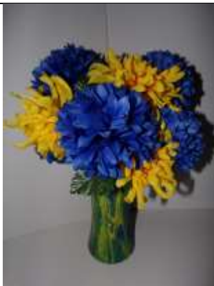
Figure 29. Vase Containing Color-Themed Craft Flowers (e.g., Local Universities, High Schools, Local Railroads, etc.)