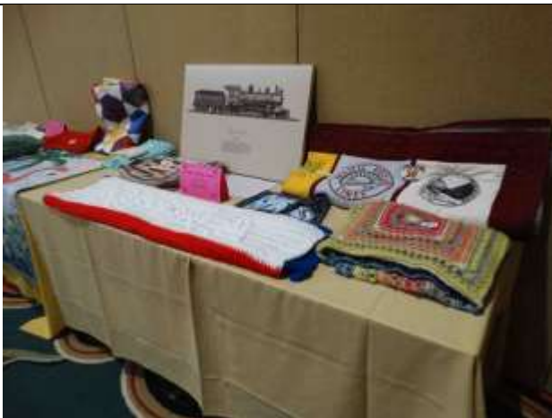
Figure 17. Selection of Railroad Themed Needlework and Railroadiana