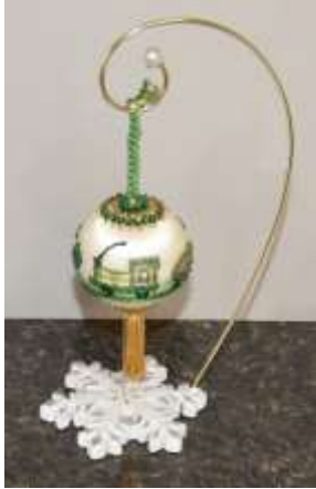
Figure 1. Christmas Ornament by Marion Manning - DSED