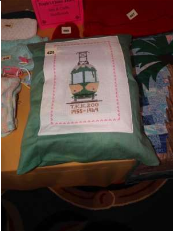
Figure 19. Railroad Themed Cross Stitch