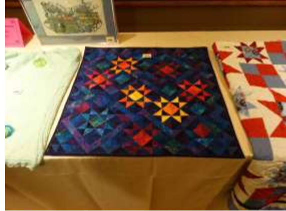
Figure 10. Non-Railroad Themed Quilt