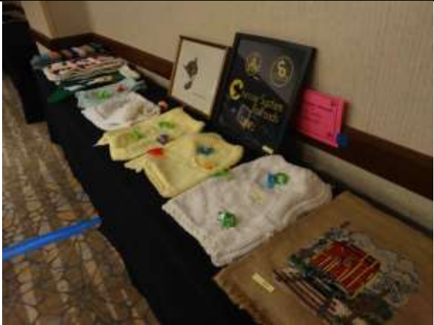
Figure 15. Selection of Railroad Themed and Non-Railroad Themed Needlework