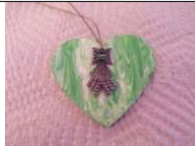
Figure 28. Poured Paint Hearts Donated to Nursing/Assisted Living Residents