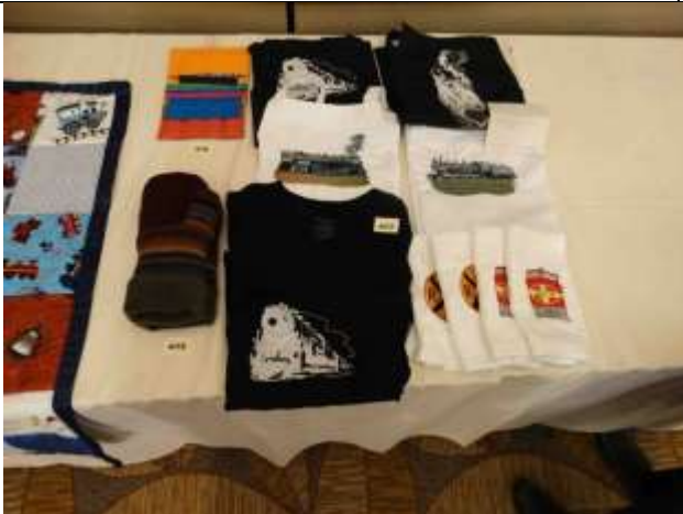
Figure 7. Railroad Themed Shirts and Towels