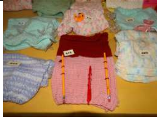
Figure 20. Non-Railroad Themed Knitting