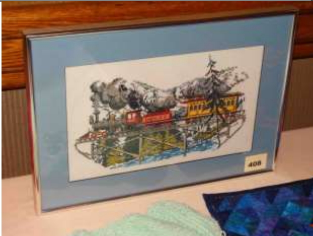
Figure 11. Railroad Themed Cross Stitch