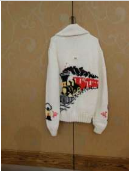
Figure 3. Railroad Themed Knitted Sweater