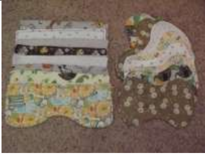
Figure 23. Sewn Baby Bibs Donated to Hospitals