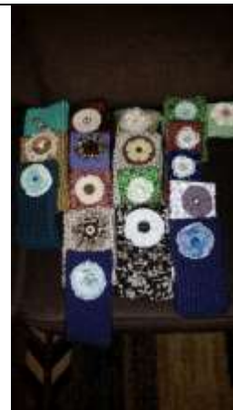
Figure 30. Headbands with Designs and Bling for Gifts or Donation