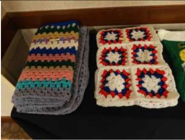
Figure 13. Non-Railroad Themed Knitting