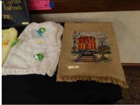
Figure 14. Railroad Themed Cross Stitch on Burlap