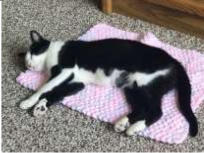
Figure 25. Knitted Cat Carrier Blankets Donated to Local Humane Societies