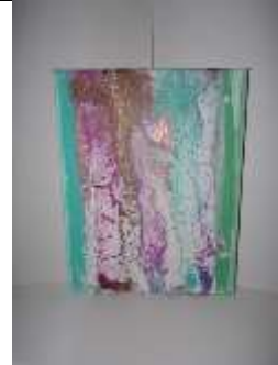
Figure 26. Poured Paint Art on Canvas