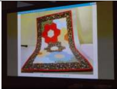
Figure 21. Quilt Shown in PowerPoint Slide Presentation