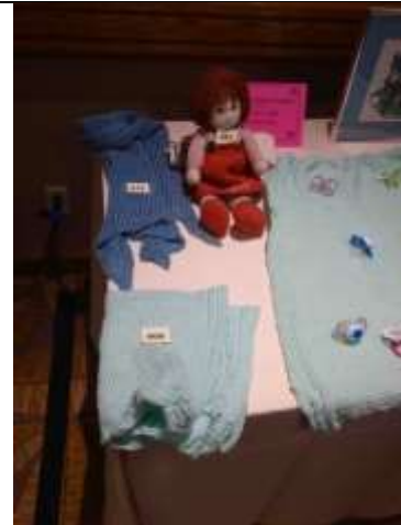
Figure 12. Non-Railroad Themed Dolls and Bibs