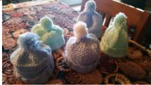
Figure 24. Knitted Preemies Hats Donated to Hospitals