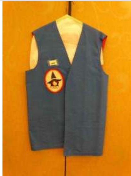
Figure 4. Railroad Themed Sewn Vest