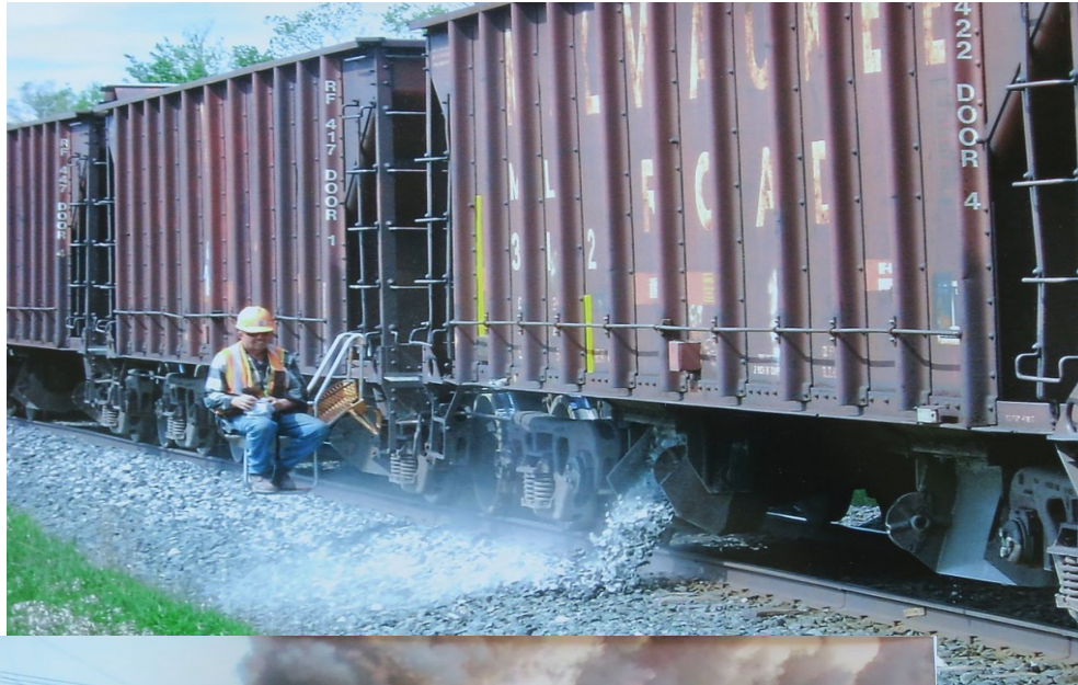
Ballast Spreading Along CP Line Out- side of Thief River Falls