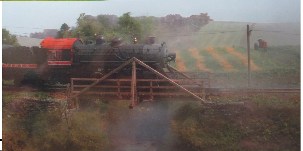
Foggy Day in the Field