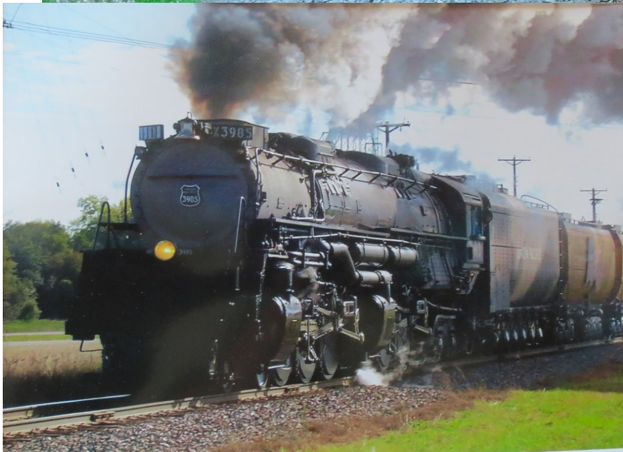
Challenger Under Steam