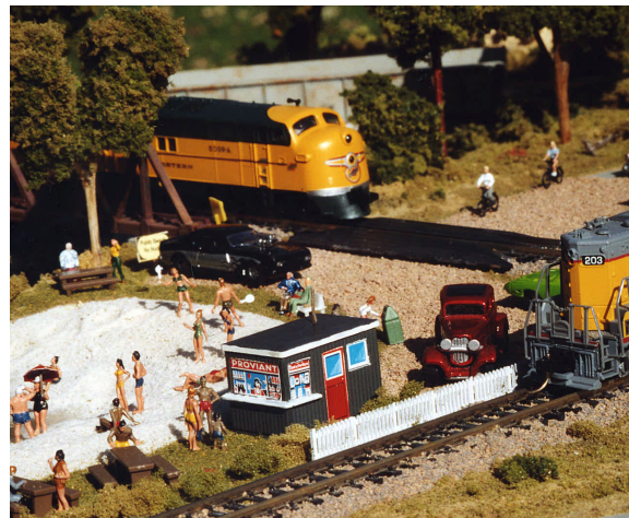
Terry Davis's N-scale CM&E layout