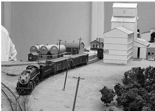
Jon Bratt's Northern Pacific layout

Please don't show up at layout tour houses early – many owners will be coming from the convention!