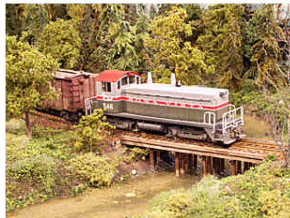
Gerry Leone's HO-scale Bona Vista Railroad