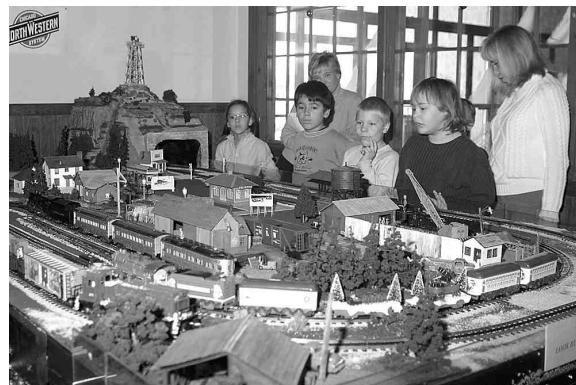
Luce Line Railroad Club Inc.'s three-rail O-scale layout