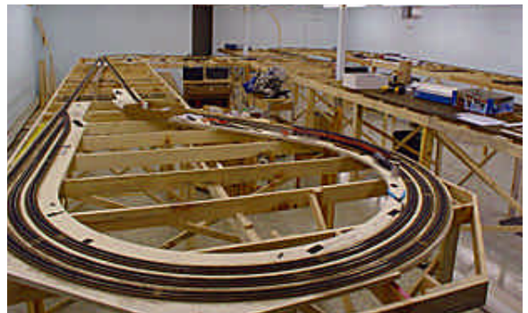
Now firmly housed in their new location, the Alexandria Model Railroad Association continues work on their layout. Pictured is the West loop.

who are carrying the bulk of the weight as far as rebuilding a new layout. Hopes are that more members will join as the layout gets more complete. Currently it runs on DCC using an NCE system. The club still carries on the tradition of running trains at shows, thanks to a donation of several modules to the AMRA by a group in St. Cloud. With a little reworking, the club built a modular layout that travels to shows in places like Willmar, Hutchinson, Staples, Starbuck, Benson, Glenwood and Brooklyn Park. Besides the train shows, the club also sets up the modules at a local nursing home several times a year.